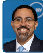
John B. King, Jr. Chancellor, State University of New York