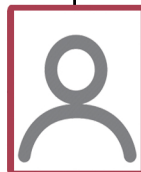
Director of Institutional Research & Planning