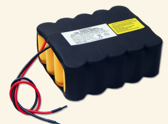
Nickel Cadmium NiCd