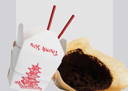
Soiled or Coated Paper