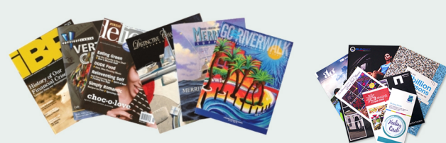
Magazines & Catalogs