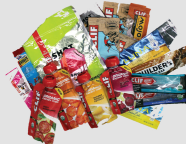
Plastic film & wrappers