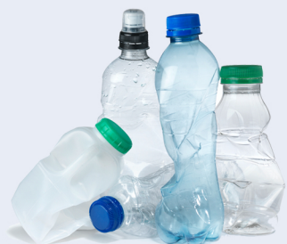
Plastic containers & Bottles