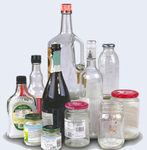
Glass Jars & Bottles